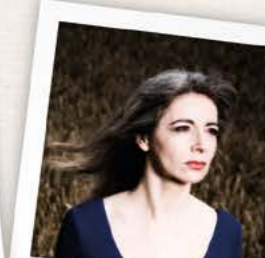
Percussion: Evelyn Glennie