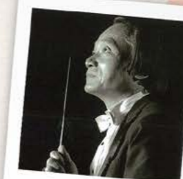
Guest Conductor: Chen Tscheng-Hsiung