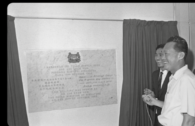
Mr Lee Kuan Yew officiating the opening of the Singapore Conference Hall on 15 October 1965 1965年10月15日，李光耀先生主持新加坡大会堂的揭幕仪式