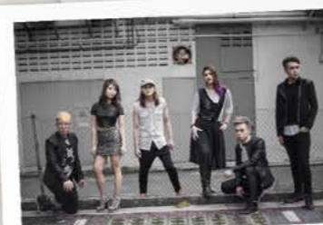
Vocal Band: MICappella